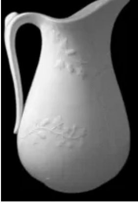
Oak and Acorn