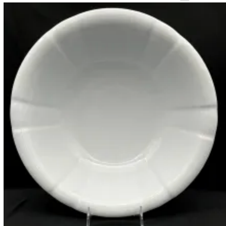
Alternate Panels with Thistle