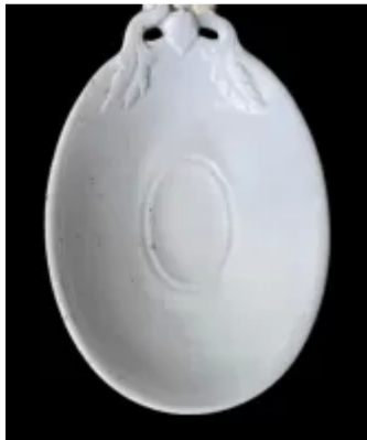
Elliot, Liddle & Son