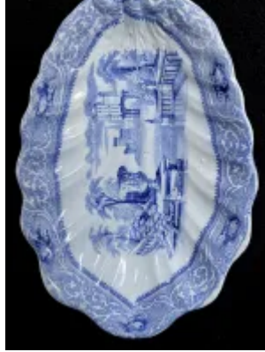
Venables, Baines, & Co.