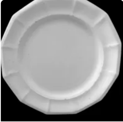
Mellor, Venables, & Co.