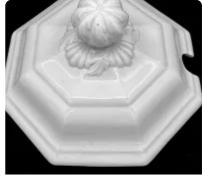
Venables, Mann, & Co.