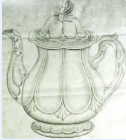
Teapot or Coffee Pot Base and Lid