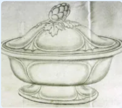
Vegetable Tureen Base and Lid