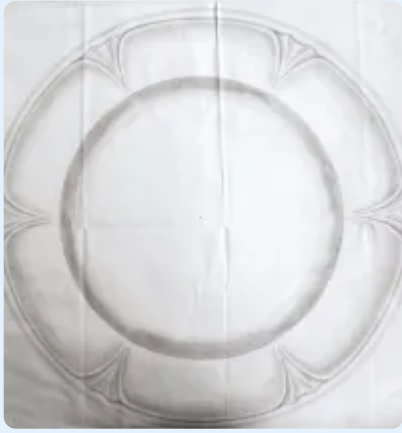
Plate - Various Sizes 4" to 10"