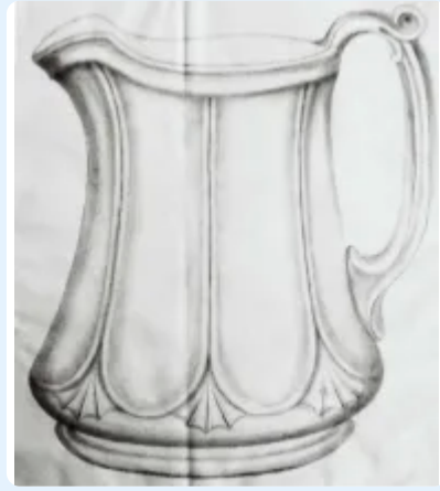
Pitcher - Table - Various Sizes