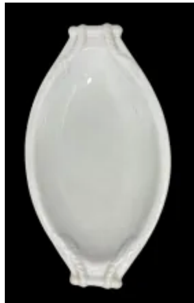
Cable and Bar