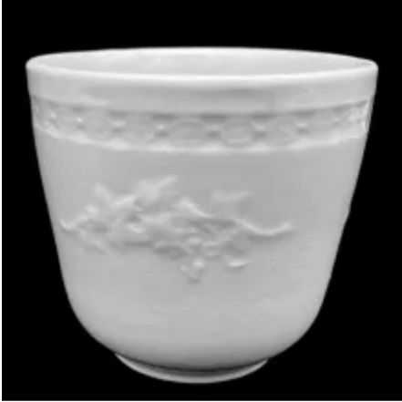
Grape Cluster with Chain