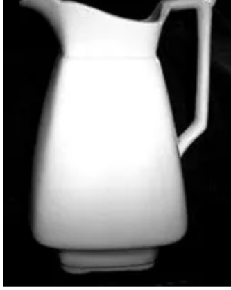
Late Square and Octagon