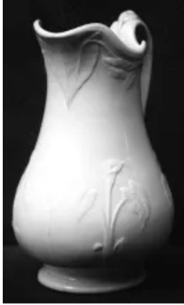
Lily Shape (Calla Lily)