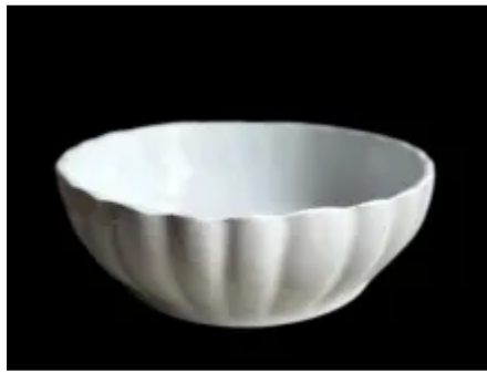
One Large Two Small Ribs