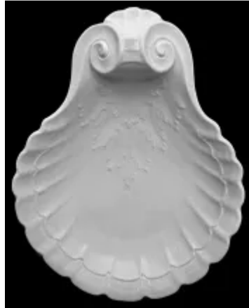
Brunt Shell Master