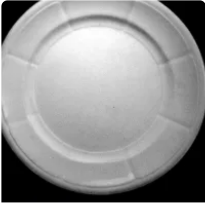
Holland & Green (Late Harvey)