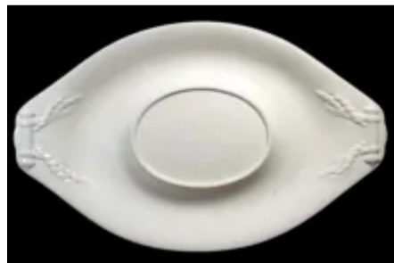
Cable and Bar