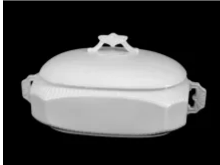
Late Square and Octagon