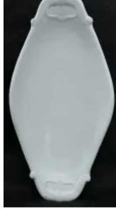
Plain Uplift - Prince of Wales