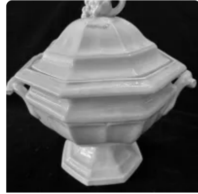
Proctor, J. & H. (& Co.)