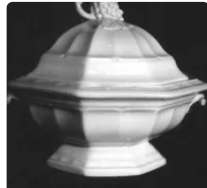
Venables, Baines, & Co.