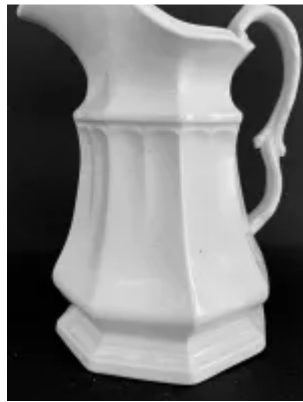
Barrow & Co.

Image not available Bradbury, Mason, & Bradbury 🔍 preview