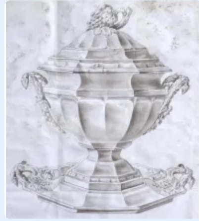
Sauce or Soup Tureen Base, Lid, and Underplate