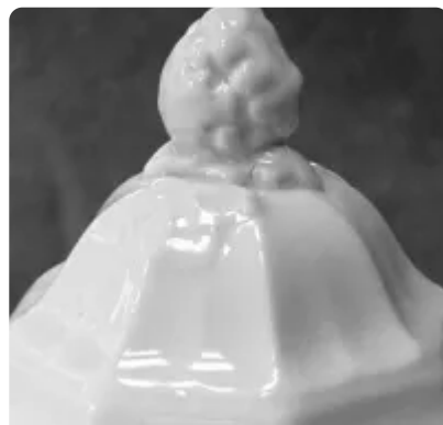
Meigh, Charles & Son