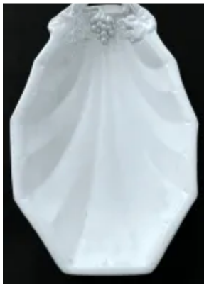
Alcock, Samuel & Co.