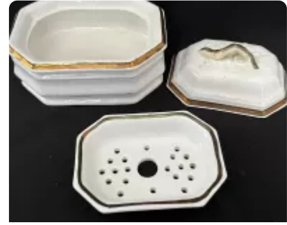
Livesley, Powell, & Co.