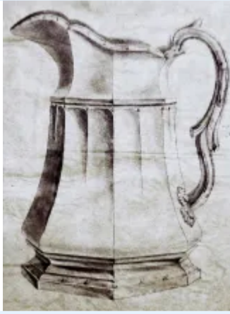
Pitcher - Table - Various Sizes