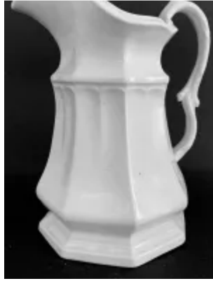
Freakley, W. & Co.