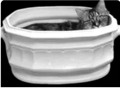
Venables, John & Co.

Image not available Venables, Mann, & Co. Q preview