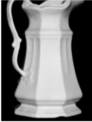
Freakley & Farrall