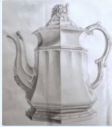
Teapot or Coffee Pot Base and Lid