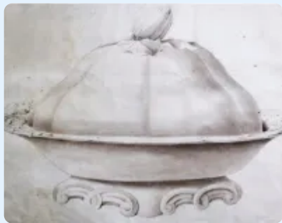
Vegetable Tureen Base and Lid