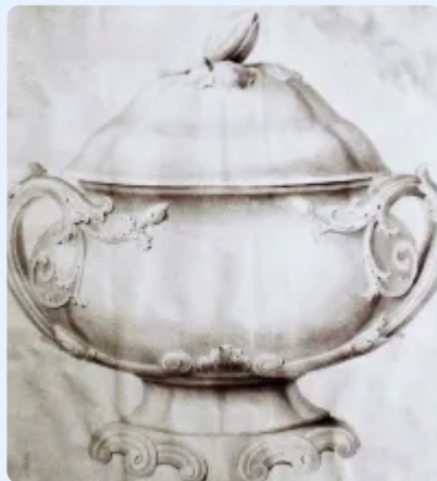
Sauce or Soup Tureen Base and Lid