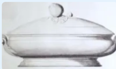
Vegetable Tureen Base and Lid