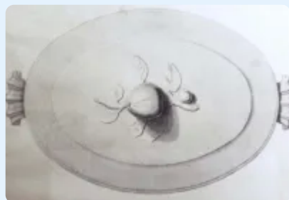
Vegetable Tureen Base and Lid