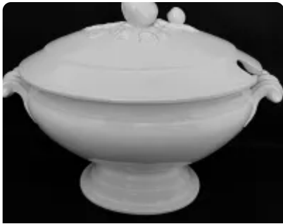
Barrow & Co.