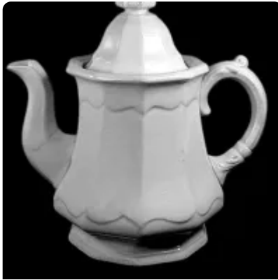
Adams, William & Sons