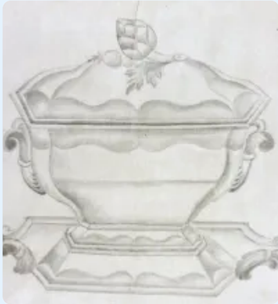
Sauce or Soup Tureen Base, Lid, and Underplate