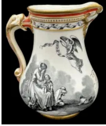
Unknown Specialty Items