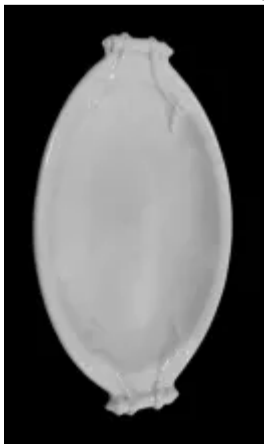
Cable and Bar