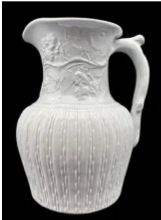
Grapes and Hops