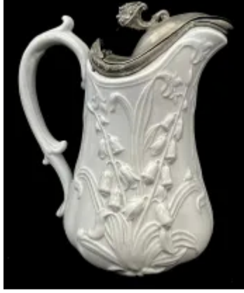
Lily of the Valley