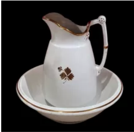
Daisy 'n Chain