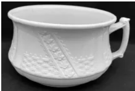
Basketweave with Band