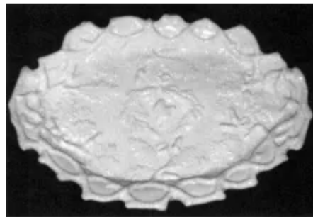
Twisted Vine with Grapes