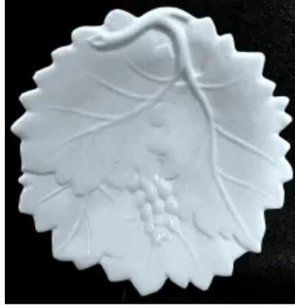
Leaf with Grape Cluster