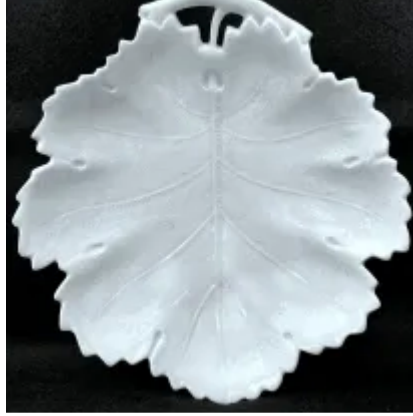
Open Handle Leaf