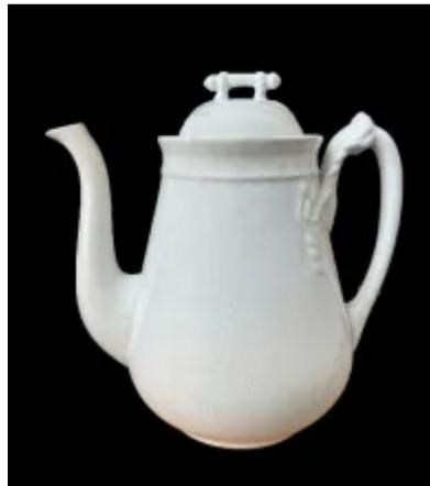
Cable and Bar