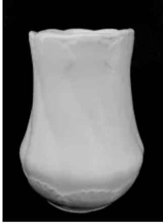
Scallop Shell Border