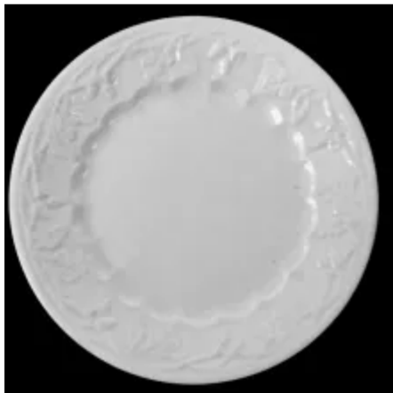
White Oak and Acorn