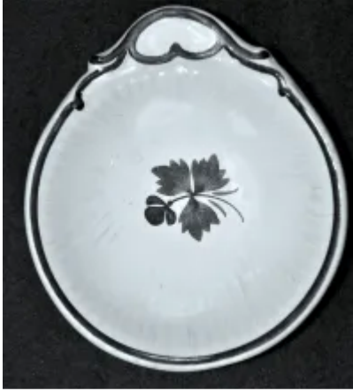
Mellor Round Ribbed