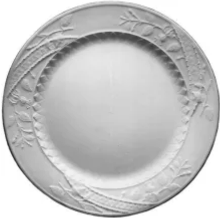
Fuchsia with Band